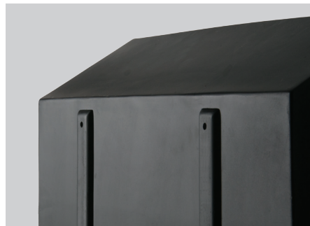
Rails on back allow for air circulation