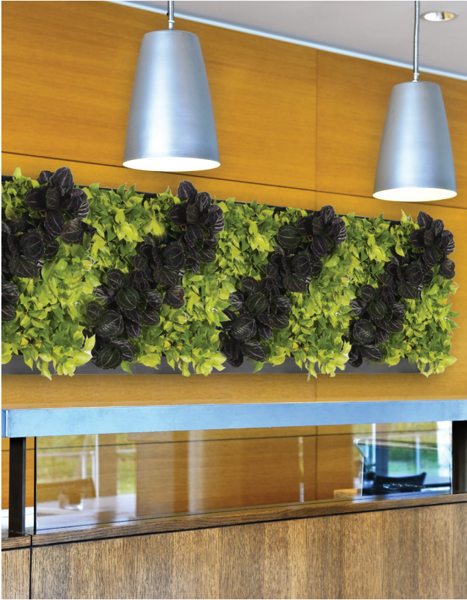
Four PP-3232's arranged horizontally