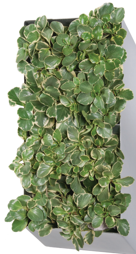
Available in 42 finishes

Simply add 3-4 wicked plants to each shelf and fill each shelf with water. Watering cycle is normally 1-2 weeks.