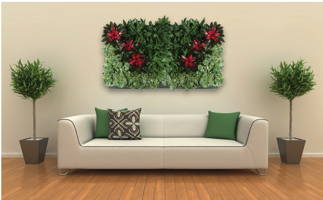
Two PP-3232's arranged horizontally